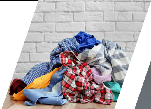
Clothes (4 days, 3 nights) Appropriate, Warm, Extra