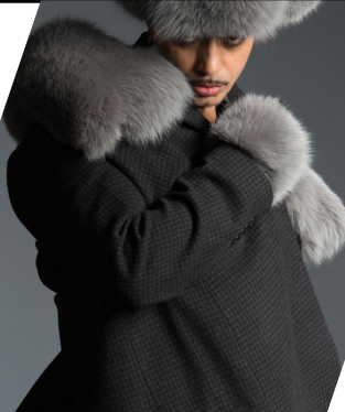
Warm coat, hat, gloves, and boots