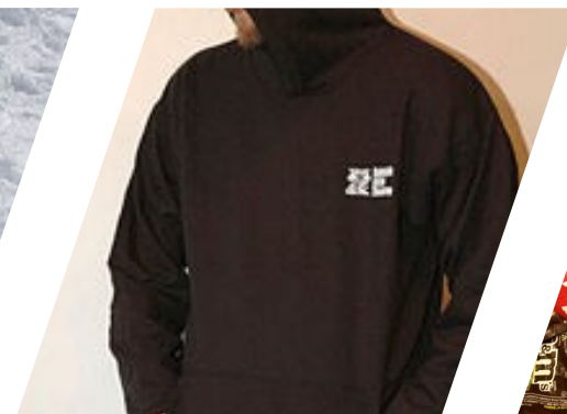
Dark/Black Outfit for Glownite