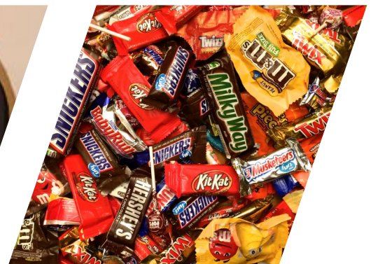
Cabin treats to share