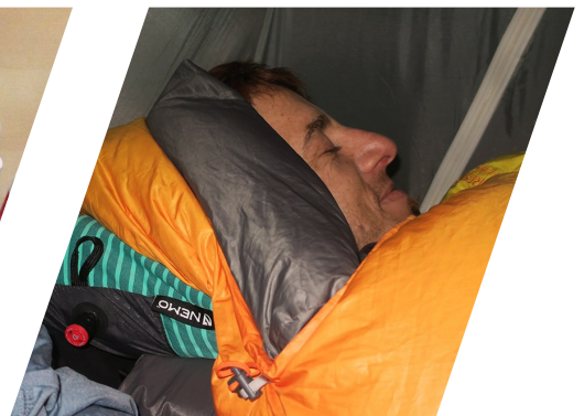
Sleeping bag and pillow