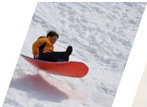
Sled if you have one